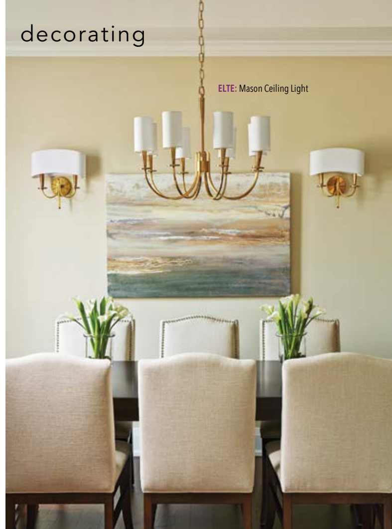
ELTE: Mason Ceiling Light

🏡 In the lovely dining room, adjacent to the living room, an elegant chandelier with matching wall sconces adds light to the space in more ways than one. The room sparkles even when the lights are turned off with the lighting's soft champagne-gold finish. Notice how the art captures the golden tones of the light fixtures while capturing the colour palette of the living/dining room to complete the space.