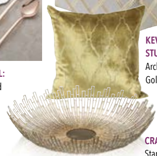
KEVIN O'BRIEN STUDIO: Metallic Arches Velvet Gold Pillow