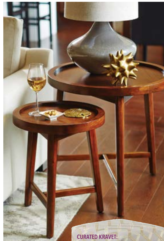
CURATED KRAVET: La Jolla Ottoman in Kravet's Join The Club Platinum Fabric

👉 Use golden accents in small doses so they don't compete but rather complete the space. Even the smallest touches of shine, whether matte or polished in golden, brassy or rosy tones, will add a golden glint you can't ignore.