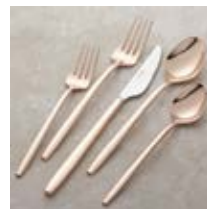
CRATE & BARREL: Harper Rose Gold Flatware